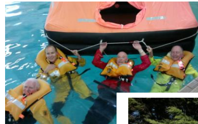
photo over left the four are seen in the drink. Whilst over right here they are all safe and sound,

Following on from the PB2 Certification training course, the next stage was for some of intrepid coxswains to carry out 'Survival at Sea' training. In the